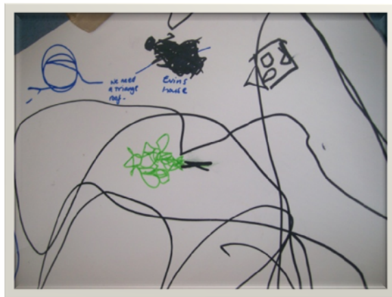
Maps drawn as a result of adding maps, atlases and mark making materials to the brick corner at Dragon's nursery

It is now hoped that the materials can be used to share effective practice with other settings. A repeat project is currently taking place with another small group of settings, with the aim of developing their practice. This group of settings have been linked to one of the beacon settings to enable them to gain ideas and support from their peers. It is hoped that a further roll out programme will be developed in the future, where other settings can be inspired and be supported by the beacon settings.