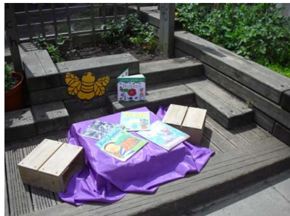
Reading area developed at Hillview Children's Centre

The initial aim was to circulate information about Early Reading Connects to six already good to outstanding (beacon) settings. This was carried out at a three hour introductory session, attended by two practitioners from each setting. These settings were asked to carry out some of the activity ideas from the Early Reading Connects materials that focused on promoting talking, early reading skills and engaging parents and also develop their own ideas and materials.