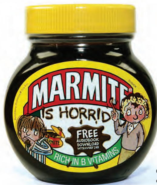
Our Reading for Life partnerships have appeared on 2m Marmite jars and in Iceland supermarkets across the UK.

As part of the Reading for Life campaign, the Great Family Escapes pilot set out to investigate attitudes to reading on holiday and to foster better engagement with reading over the long summer break. Launched in summer 2009, the pilot engaged parents and school-age children with fun reading activities, establishing a greater association with reading as a pleasurable and sociable family activity. The project was informed by research from the National Year of Reading that identified the importance of seeing reading as an enjoyable family activity, and reported improved enjoyment of reading in around 51,000 participants.