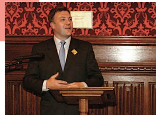
Ed Balls, Secretary of State for Children, Schools and Families, speaking at one of our events at the House of Commons.

Research and evidence lie at the heart of our work shaping policy and practice to improve literacy levels. In 2008/09 we undertook systemic public policy analysis and research on issues relating to literacy and shared our findings with teachers, other professionals and sponsored bodies. We conducted new research and compiled evidence from different sources on the impact of literacy on life chances, the successful promotion of literacy and effective methodologies to support improved literacy outcomes. This research activity also helped our work to encourage more sectors to prioritise literacy.