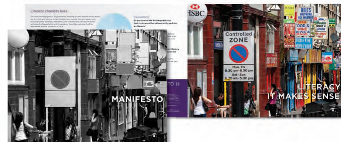
Our Manifesto for Literacy calls on political parties to prioritise literacy.

In September 2009, we launched our Manifesto for Literacy , calling on political parties to prioritise literacy in their manifestos for the anticipated May 2010 election. Developed in consultation with over 30 national organisations, the Manifesto shows how poor literacy in the UK creates barriers to achievement, undermines a skills-based economy and causes acute social and cultural problems that divide communities. The Manifesto makes specific recommendations for government to develop literacy support for families, to modernise literacy in the curriculum and to run a national campaign taking literacy to new audiences.